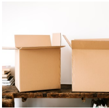
National Project Update