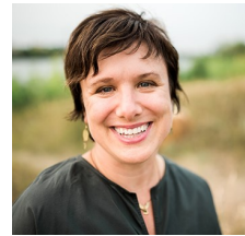
Team Member Profiles from across Canada