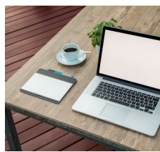
Expert Community on Housing